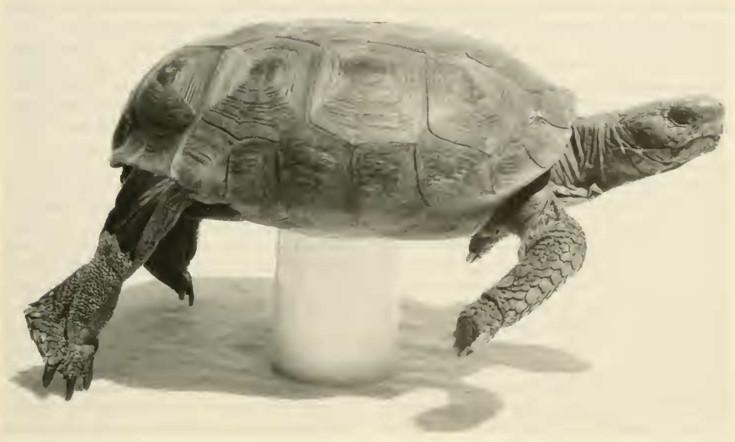
Fig. 1. Xerobates lepidocephalus : holotype, BYU 39706, from near the Buena Mujer Dam, Baja California Sur.

examined 29 live specimens of G. agassizii (5 specimens from Sonora, 24 from California), 6 live X. berlandieri , 1 live G. flavomarginatus , and 1 live G. polyphemus . Photographs of other specimens were also used to aid in our diagnoses and include: 18 X. agassizii (11 from USA and 7 from Sonora), 4 X. berlandieri , 3 G. flavomarginatus , and 5 G. polyphemus . Shell terminology was taken from Woodbury and Hardy (1948) and Carr (1952). Bone terminology follows Auffenberg (1966, 1976) and Bramble (1982). Shell measurements were taken following Woodbury and Hardy (1948), using a high-quality, steel meter stick "in planes parallel to or at right angles to a flat surface upon which the tortoise was resting" (Woodbury and Hardy 1948: 154). Head measurements were taken using a Venier caliper at the widest part of the head (width) and from the tip of the snout to the posterior border of the parietal scales (length). Hindlimb length was taken by measuring the distance from the edge of the plastron to the base of the first nail when the limb was fully extended. Figures depicting cranial, vertebral, and carpal characters were taken from radiographs and/or adapted from Bramble's (1982) ink drawings.